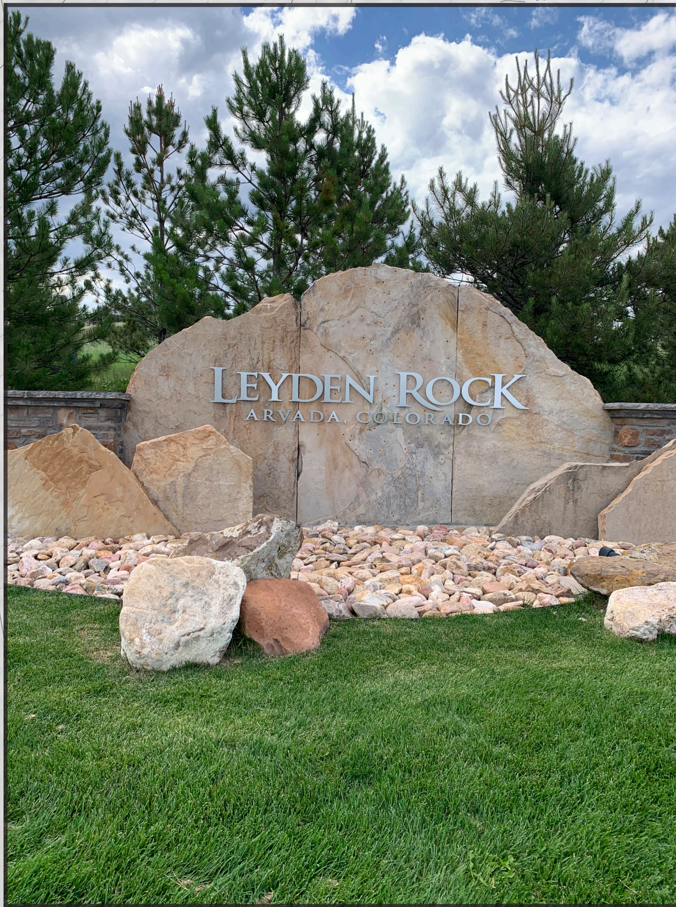
STONE SLAB AT LEYDEN ROCK DRIVE ENTRANCE